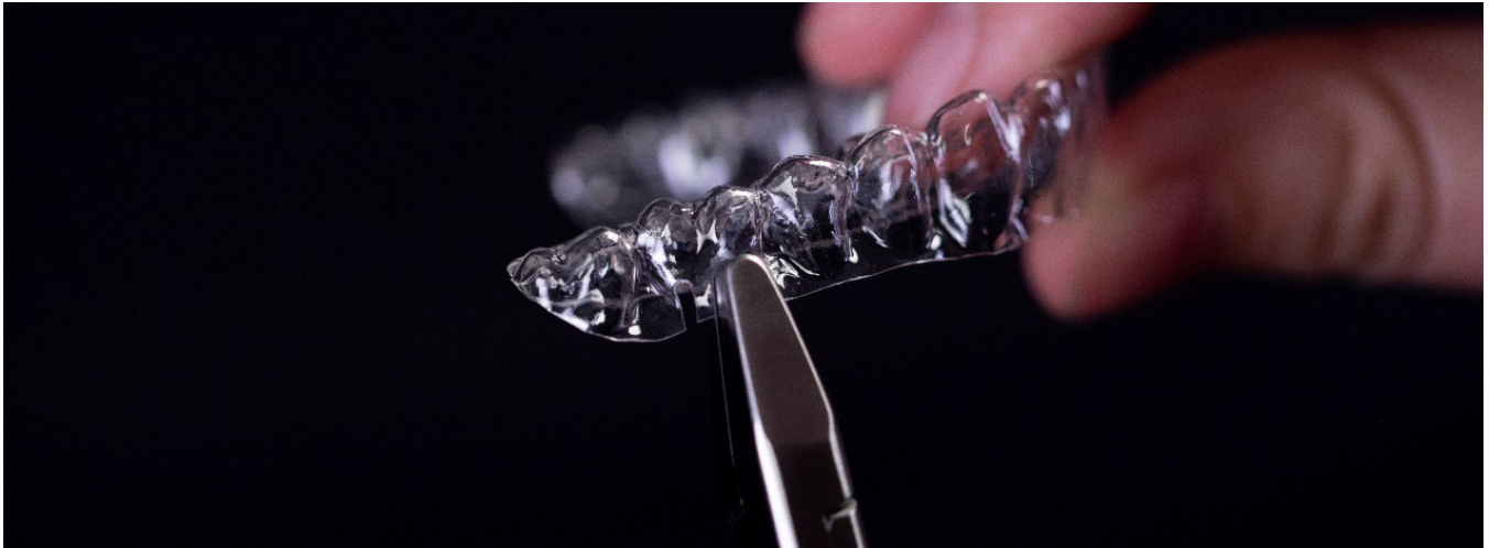
Double Slit Cutout above Upper Arch First Molar

1. Modify the upper aligner(s) to prepare for using elastics with slit cutouts in the aligner: Use an aligner slit punch plier to create a double slit cutout on the gingival margin above upper molars and where the elastic will attach.