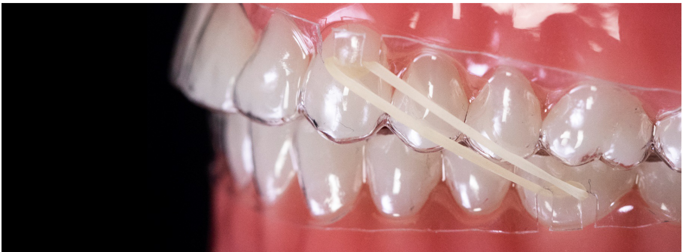
Slit to Slit Cutout

3. Elastic placement: Insert the aligner and pull the elastic over the piece of gingival margin between the two slits above the canines. Then stretch the elastic and pull it over the gingival margin between the two slits beneath the lower molars.