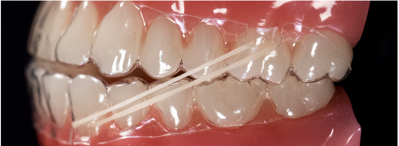
Slit to Slit Cutout

3. Elastic placement: Insert the aligner and pull the elastic over the piece of gingival margin between the two slits above the molars. Then stretch the elastic and pull it over the gingival margin between the two slits beneath the lower canines.