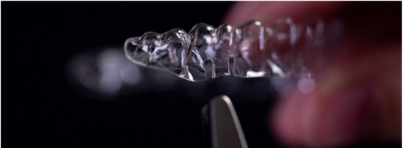
Double Slit Cutout below Lower Arch First Molar

2. Modify the lower aligner to prepare for using elastics with slit cutouts in the aligner: Use an aligner slit punch plier to create a double slit cutout on the gingival margin below the molars.