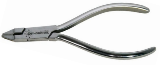
Aligner slit punch plier