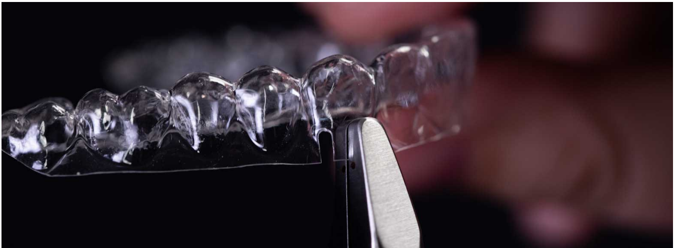
Double Slit Cutout above Upper Arch Canine

1. Modify the upper aligner(s) to prepare for using elastics with slit cutouts in the aligner: Use an aligner slit punch plier to create a double slit cutout on the gingival margin above upper canines and where the elastic will attach.